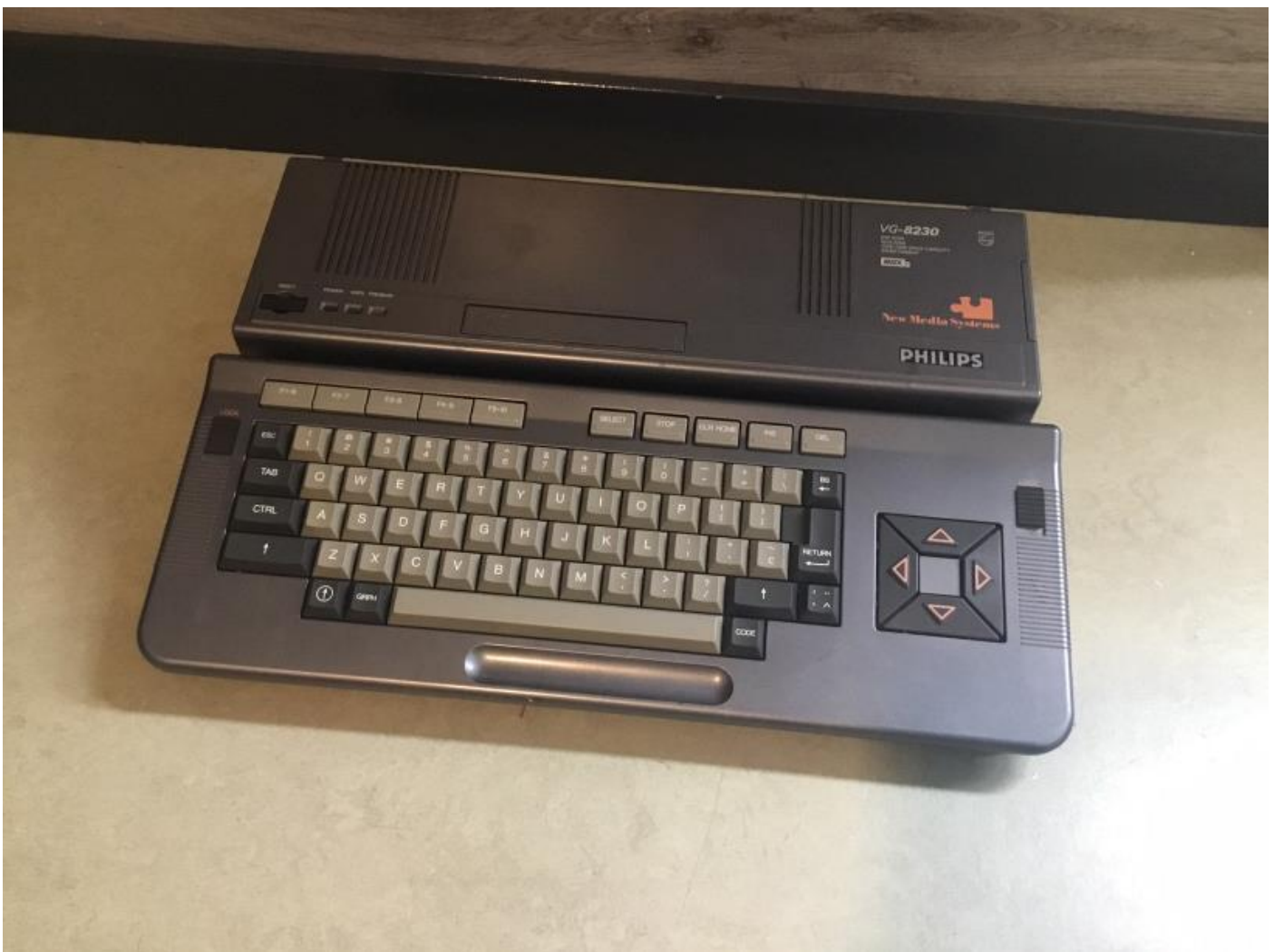
The Philips VG 8230 MSX-2 computer.